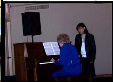
More festival photos