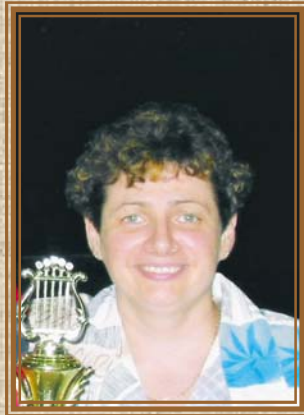
Kara Cloud Voice